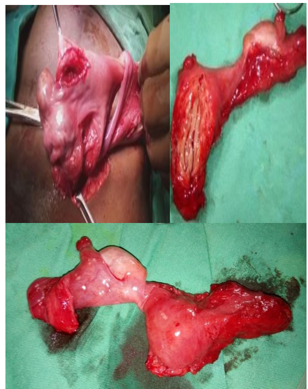
Figure 4: Uterine structure found during surgery.

Histopathological examination revealed Testicular atrophy with complete maturation arrest with no evidence of neoplasia. Sertoli cells, Leydig cell hyperplasia,