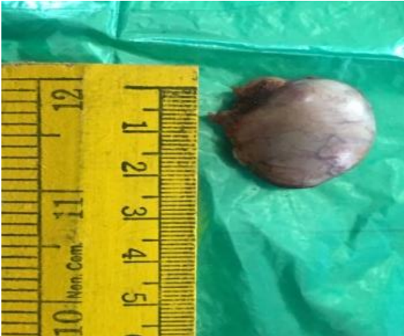
Figure 6: Excised left testis.