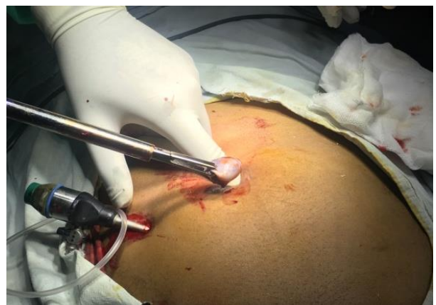
Figure 5: Umbilical port site removal of left testis.