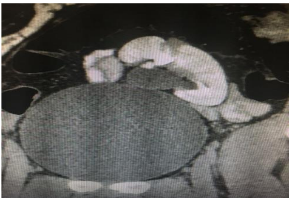
Figure 2: On CECT abdomen and pelvis s/o left ectopic testis with ipsilateral kidney.

CT scan A+P s/o left testis is not visualised in left scrotal cavity. There is well defined homogenously enhancing structure in left iliac fossa, 1 inch superior and lateral to mid inguinal point, left ectopic testis. Left kidney is also ectopic position lying in L4-L5 is malrotated in position within pelvis rotated medially. All biological markers are within normal rang (Figure 2-5).