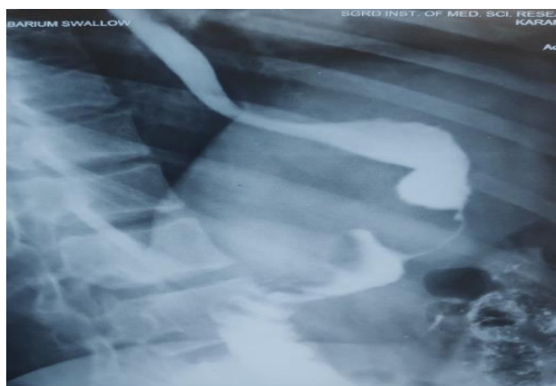
Figure 1: Diffuse gastric stricture.

Details of the records of patient with isolated gastric or predominant gastric injury were reviewed with attention to presenting features, interval between time of ingestion and presentation to hospital, etiology of ingestion, management done, immediate and long-term outcome.