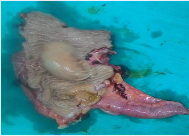
Figure 1: Gross specimen shows resected distal ileum, caecum with rounded cyst, ascending colon. The appendix appears normal.

significant abnormality. Colonoscopy revealed a polypoid mass arising from caecal area protruding into the colonic lumen. But due to wide base and unknown etiology of mass colonoscopic removal was avoided.